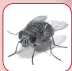
Lesser House Fly