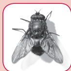
Common House Fly